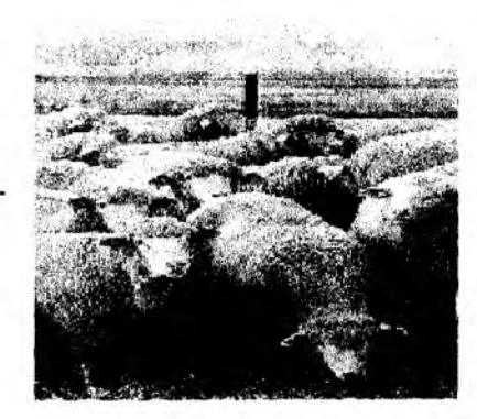
Exercise 6. Reading for comprehension: How similar are animals and human beings?

Over the centuries, a number of animals have been charged with a crime, tried in a court of law, found guilty and punished even executed. The last time was as recently as 1906. Animals were thought to be like human beings - able to decide their actions and morally responsible for the outcomes.