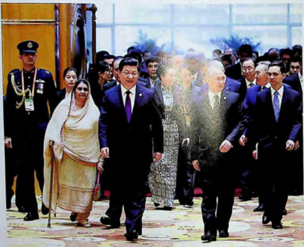
Hosting a welcoming banquet on behalf of the Chinese government and people at the Shanghai International Conference Center for guests attending the Fourth Summit of the Conference on Interaction and Confidence-Building Measures in Asia, May 20, 2014.