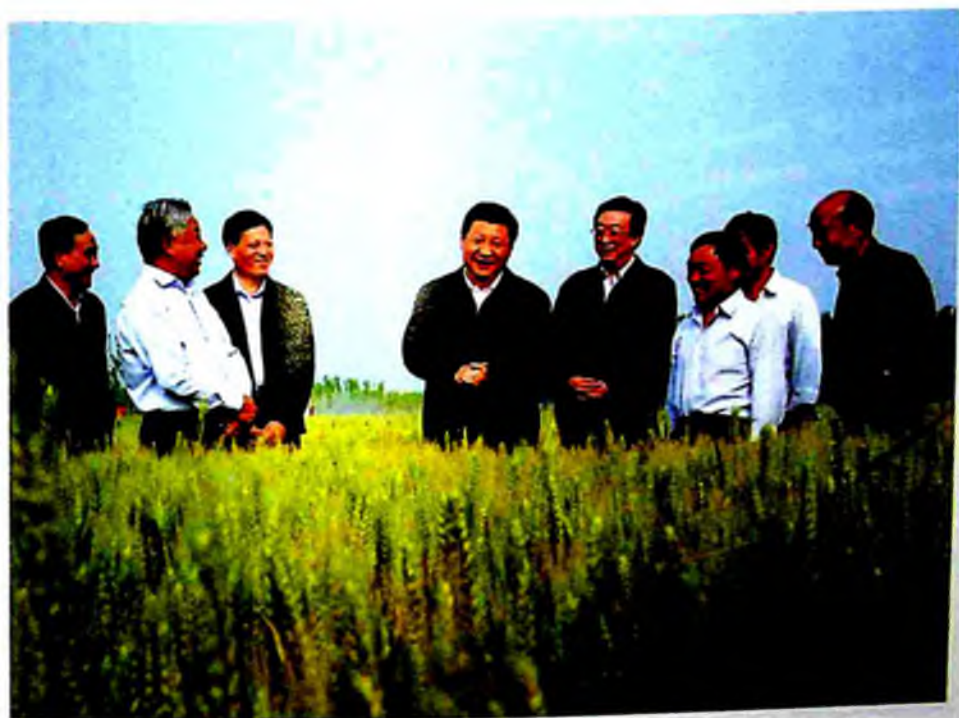
Checking the growth of wheat in Zbangshi Township, Weishi County, on an inspection tour in Henan Province, May 9, 2014.