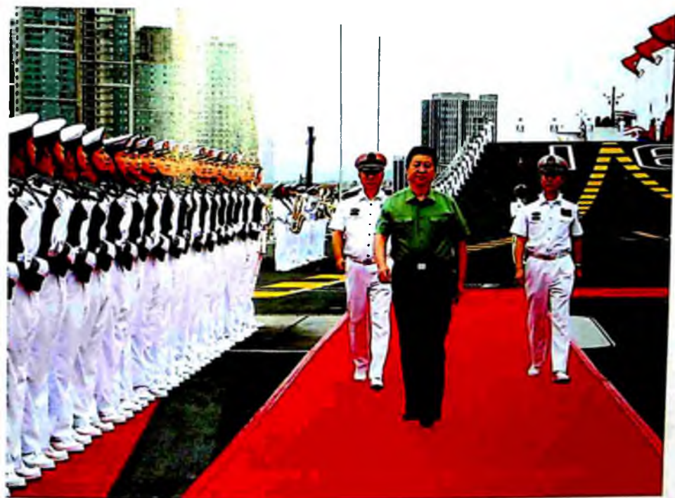
Reviewing the marine guard of honor on the Liaoning, China's first aircraft carrier, August 28, 2013.