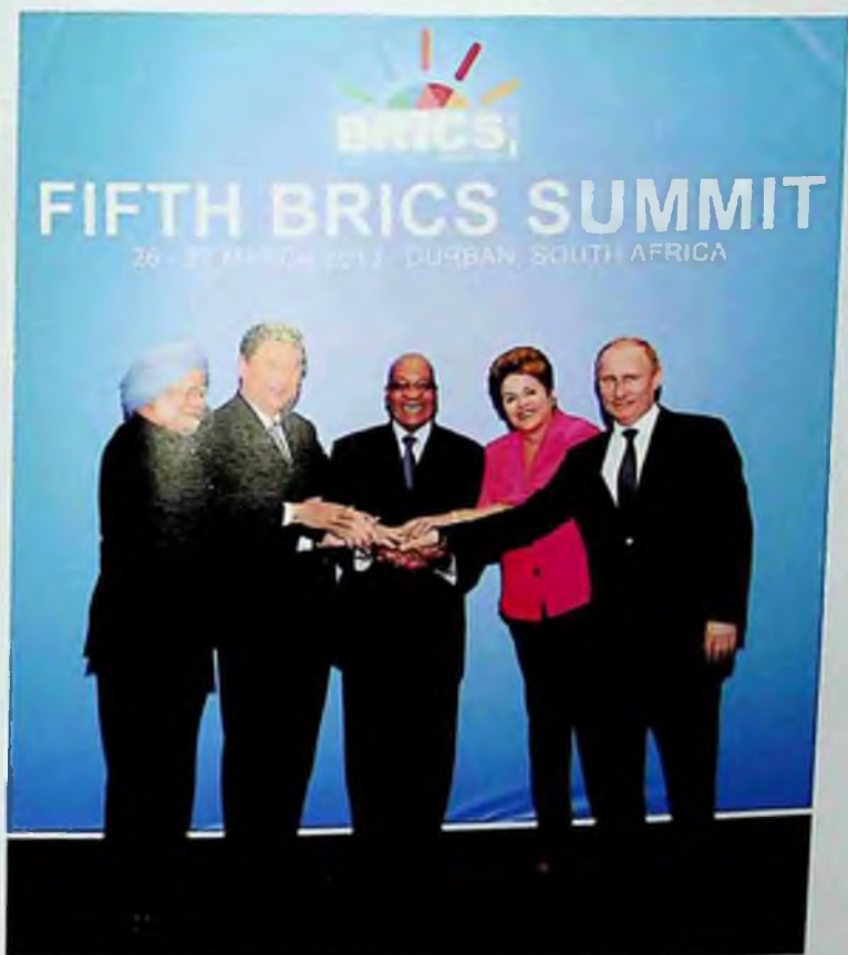
Attending the Fifth BRICS Summit in Durban, South Africa, March 27, 2013.