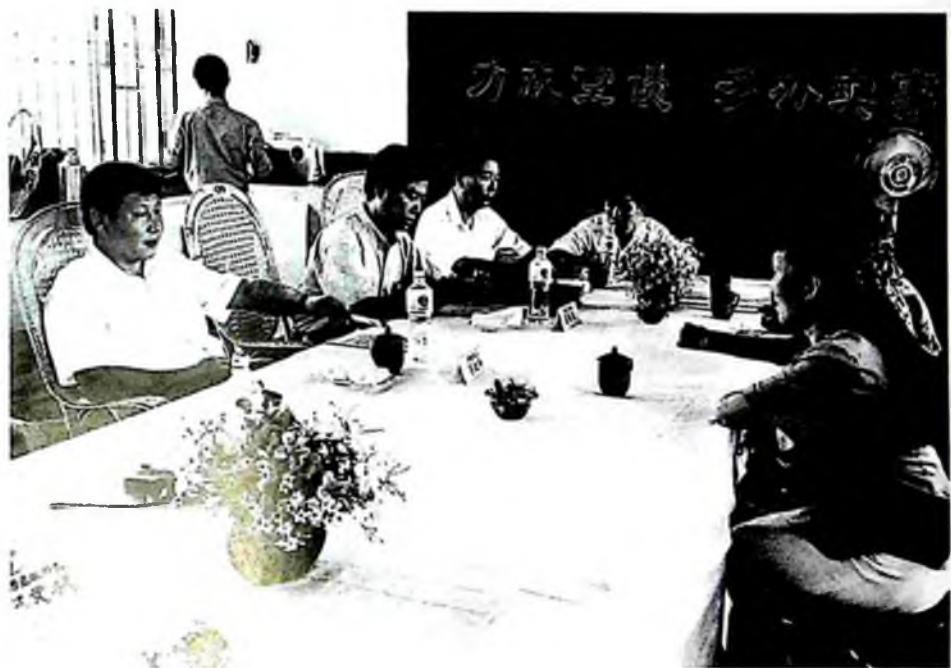
Receiving guests on the joint open day for officials of Fuzhou City and Taijiang District, August 1992. Xi Jinping was then secretary of Fuzhou Municipal Party Committee, Fujian Province.