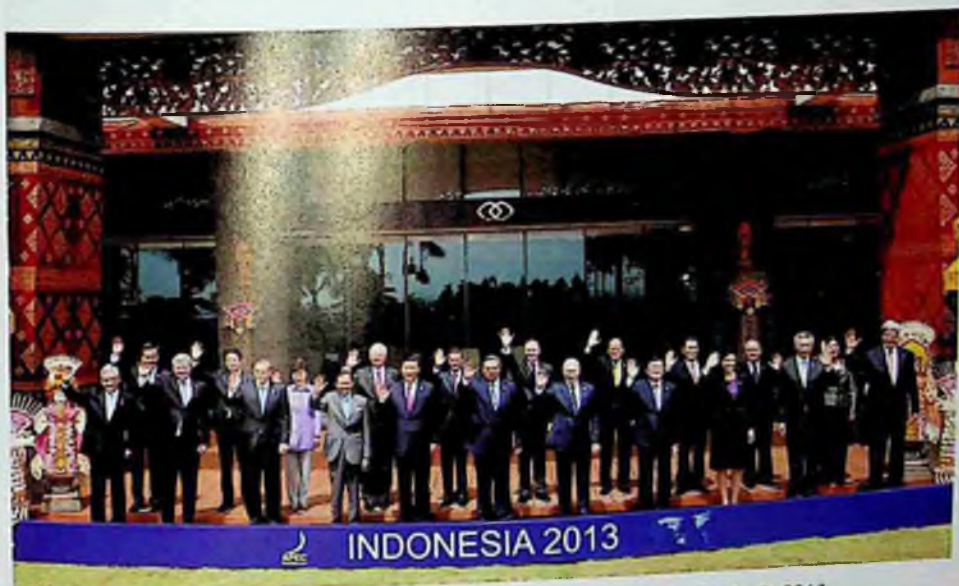
Attending the 21st APEC Economic Leaders' Meeting, Bali, Indonesia, October 8, 2013.