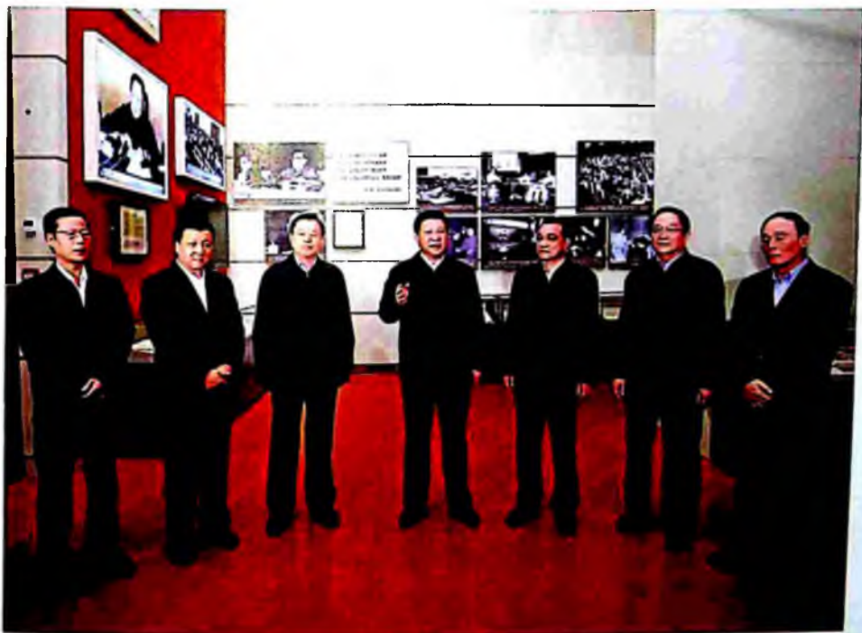
Visiting "The Road to Rejuvenation" exhibition at the National Museum of China, along with other leaders, namely Li Keqiang, Zhang Dejiang, Yu Zhengsheng, Liu Yunshan, Wang Qishan and Zhang Gaoli, November 29, 2012, when he for the first time put forward the idea of the Chinese Dream of national rejuvenation.