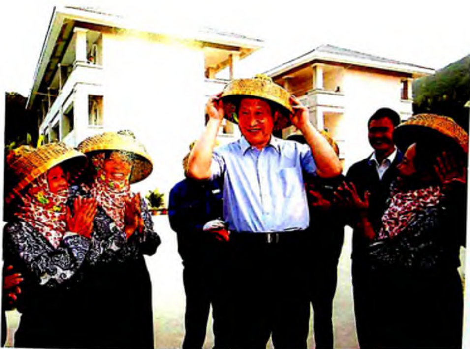
Putting on a bamboo hat given to him by local Li ethnic people at Lande Rose Cultural Park on Yalong Bay, during an inspection tour of Hainan Province, April 9, 2013.