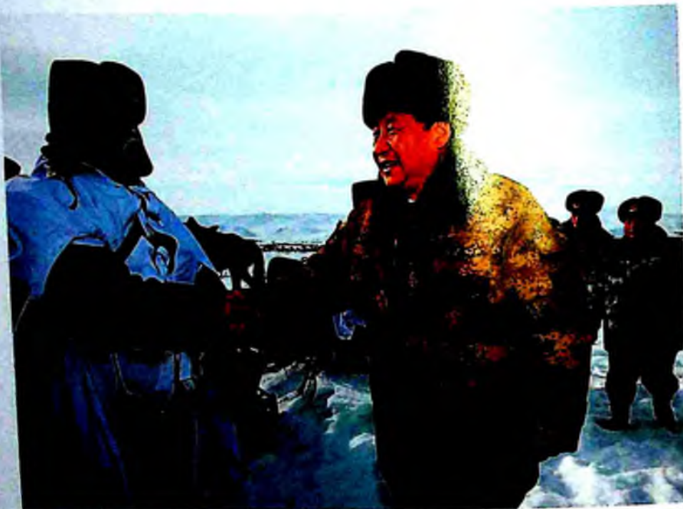
With a soldier on a patrol along the border in Arxan area of the Inner Mongolia Autonomous Region, January 26, 2014. The local temperature was below -30^{\circ}\text{C} .