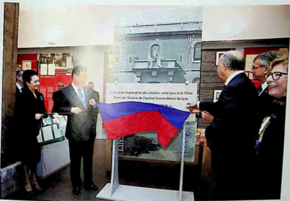
At the inauguration ceremony, with his wife, Peng Lijuan, of the Center for the Promotion of China-Lyons Relations and the Museum of History of Université Franco-Chinoise, during his visit to the original site of the university, Lyons, France, March 26, 2014.