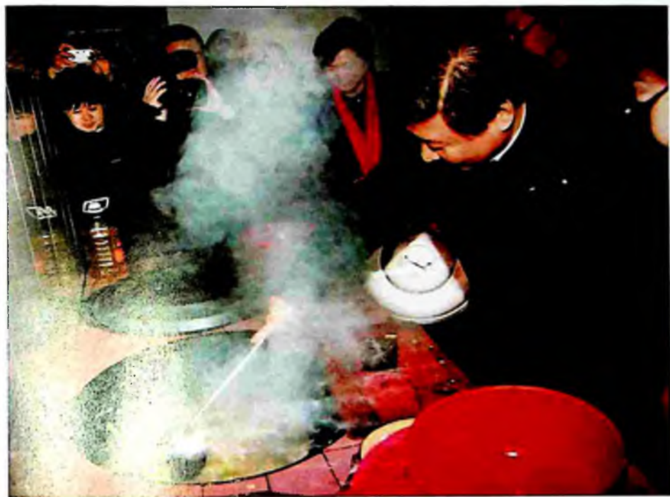
While visiting the Pingdu Township Nursing Home, Qingyuan County, Zhejiang Province, January 2007, he cooked for the elderly. He was then secretary of Zhejiang Provincial Party Committee.