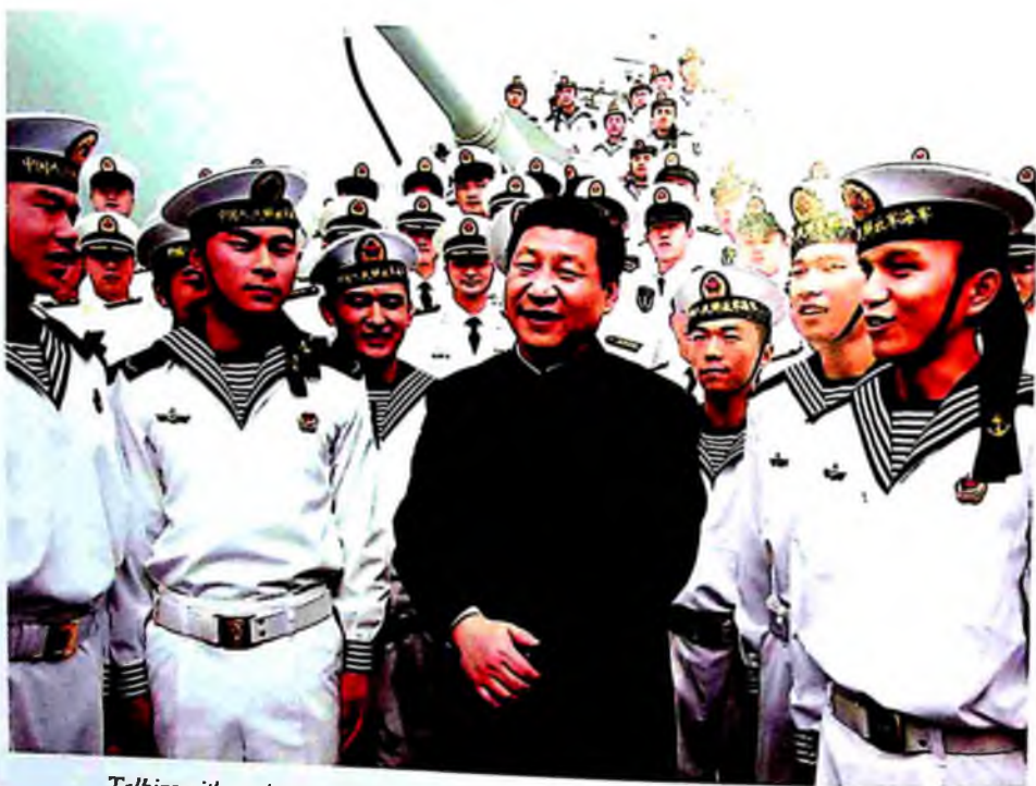
Talking with marines on the navy vessel Haikou, December 8, 2012.