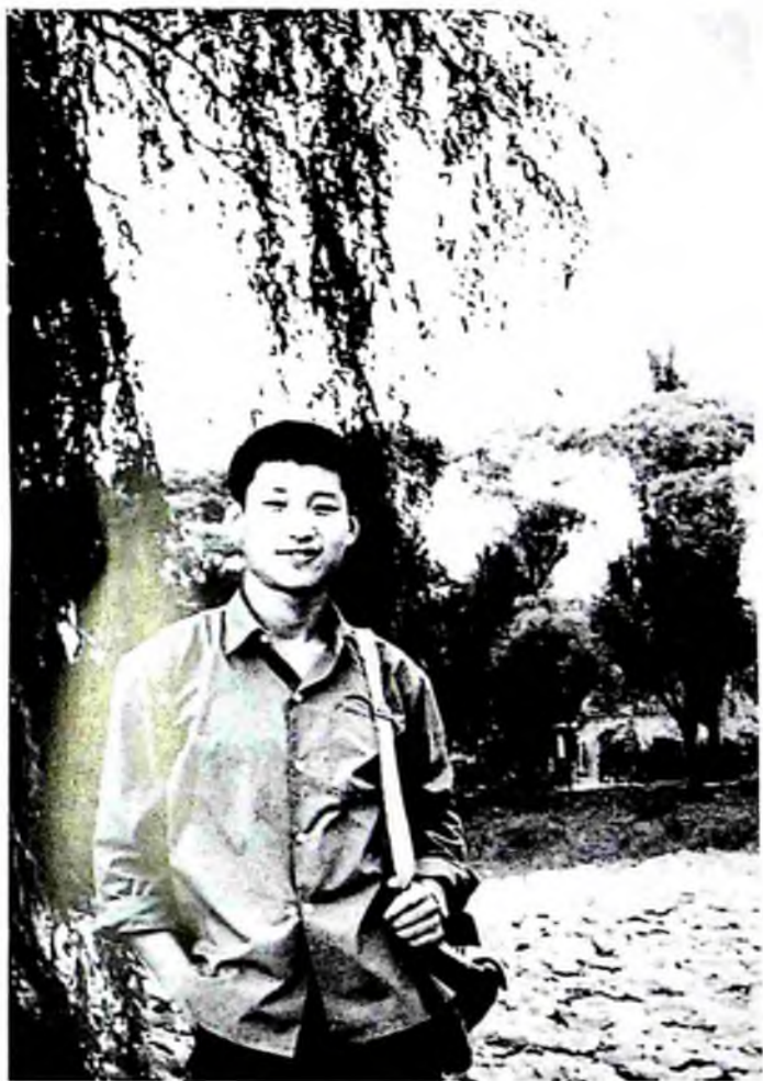
This photo was taken in 1972 when he came back to Beijing to see his parents from a village in Shaanxi Province where he was working as an "educated youth."