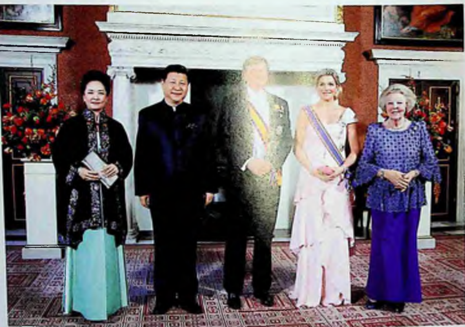
At a state banquet with his wife, Peng Liyuan, in their honor given by King Willem-Alexander of the Netherlands at the Royal Palace in Amsterdam, March 22, 2014.