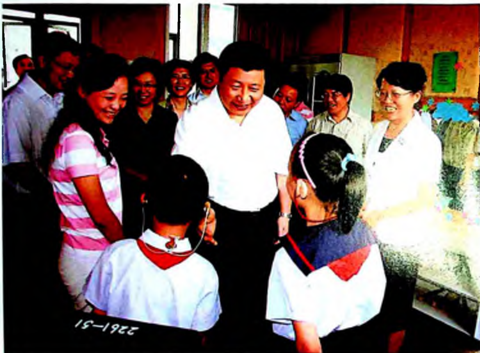
Chatting with hearing-impaired children at Qiyin School in Minhang District, Shanghai, September 2007. He was then secretary of Shanghai Municipal Party Committee.