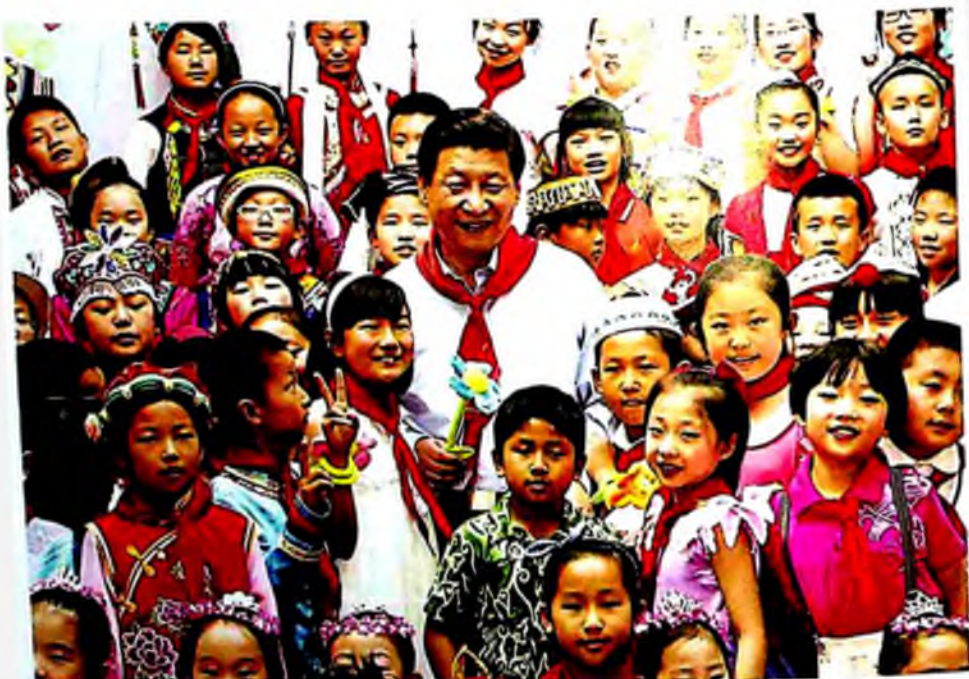
With children during a Young Pioneers activity themed "Happy Childhood with Dreams" at Beijing Children's Palace, May 29, 2013.