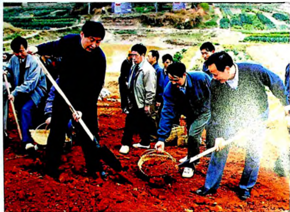
Joining a team to reinforce the dyke to prevent flooding in the lower reaches of the Minjiang River in Minhou County, December 1995. He was then secretary of Fuzhou Municipal Party Committee, Fujian Province, and deputy secretary of Fujian Provincial Party Committee.