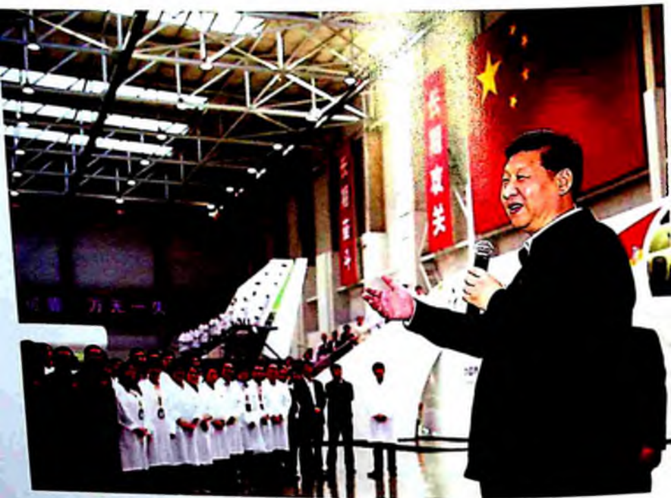
Speaking to sci-tech personnel of the Design, Research and Development Center, May 23, 2014, while visiting Commercial Aircraft Corporation of China, Ltd.