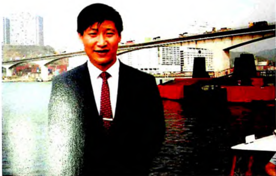
This photo was taken during an overseas visit when he was deputy mayor of Xiamen City, Fujian Province.