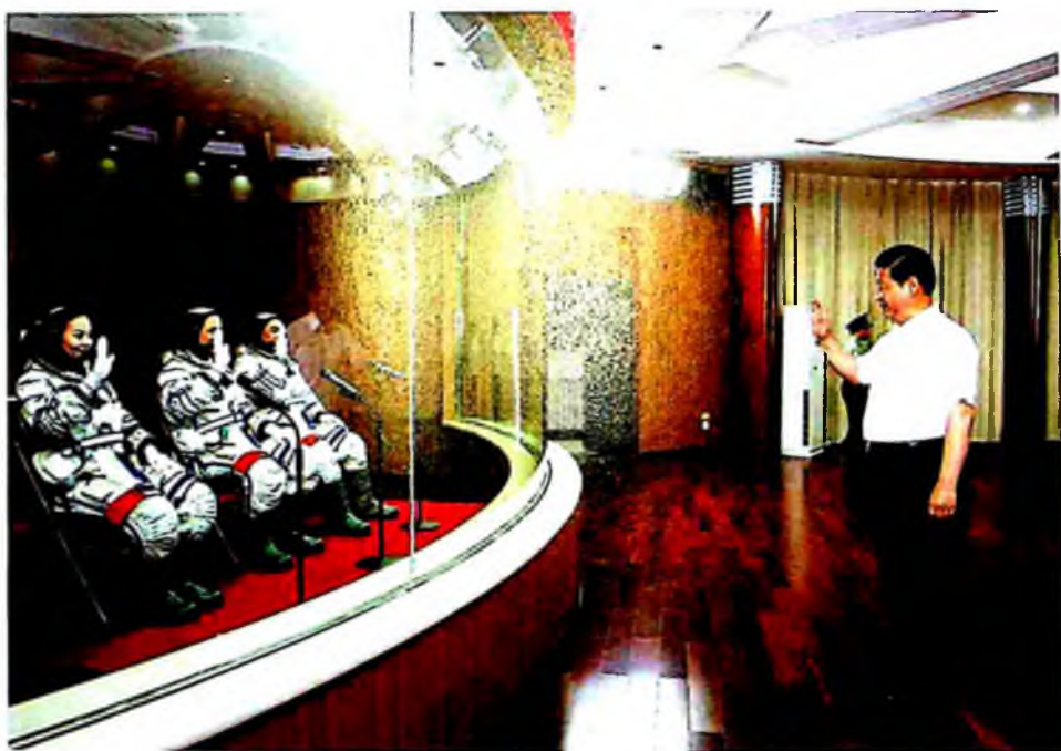
Greeting astronauts Nie Haisheng, Zhang Xiaoguang and Wang Yaping prior to the launching of the Shenzhou 10 manned spacecraft at the Jiuquan Satellite Launching Center in Gansu Province, June 11, 2013.