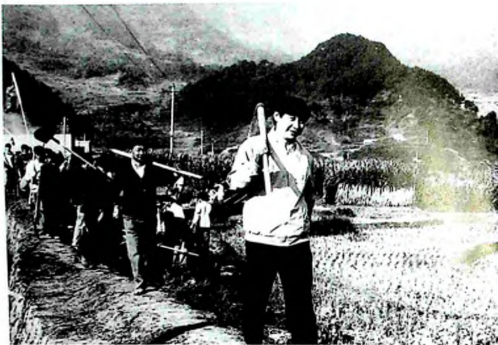
Working together with locals during an inspection tour in 1989 when he was secretary of Ningde Prefectural Party Committee, Fujian Province.