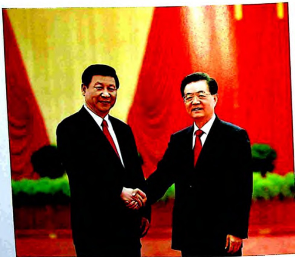
Shaking hands with Hu Jintao, his predecessor, when meeting with specially-invited deputies and non-voting deputies to the 18th CPC National Congress, at the Great Hall of the People in Beijing, November 15, 2012.