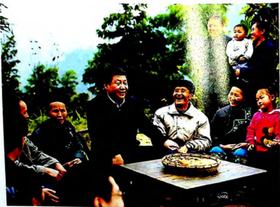
Chatting with farmers of Shibadong Village, Huaynan County, Xiangxi Tujia and Miao Autonomous Prefecture, during an inspection of Hunan Province, November 3, 2013.