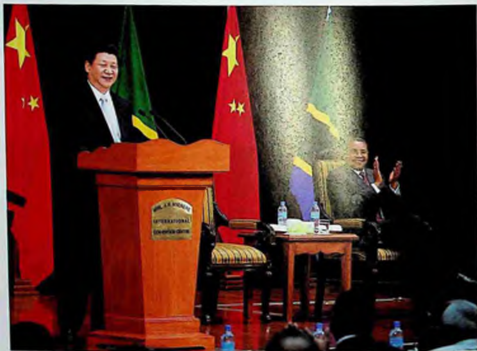
Speaking at the Julius Nyerere International Convention Center in Dar es Salaam, Tanzania, March 25, 2013.