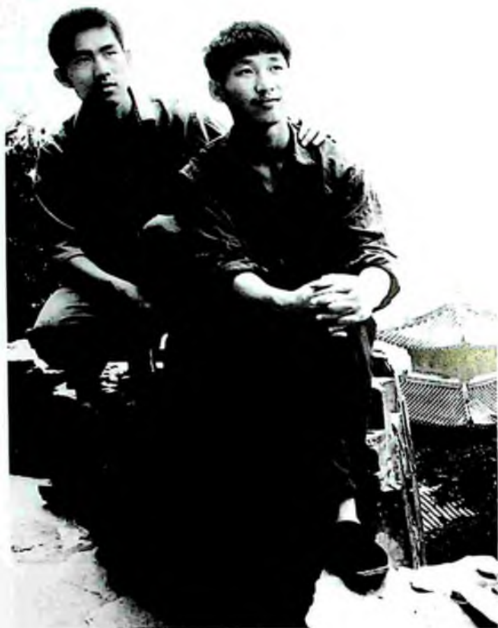
This photo was taken in 1977 when he was a student at Tsinghua University (right).