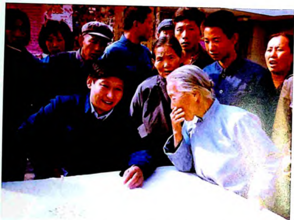
In 1983, Xi Jinping, as Party secretary of Zhengding County, Hebei Province, set a table in the street to collect opinions of local residents.