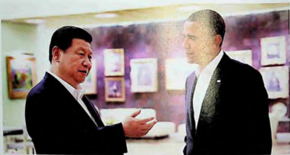
Meeting with US President Barack Obama at Sunnylands, California, USA, June 7, 2013.