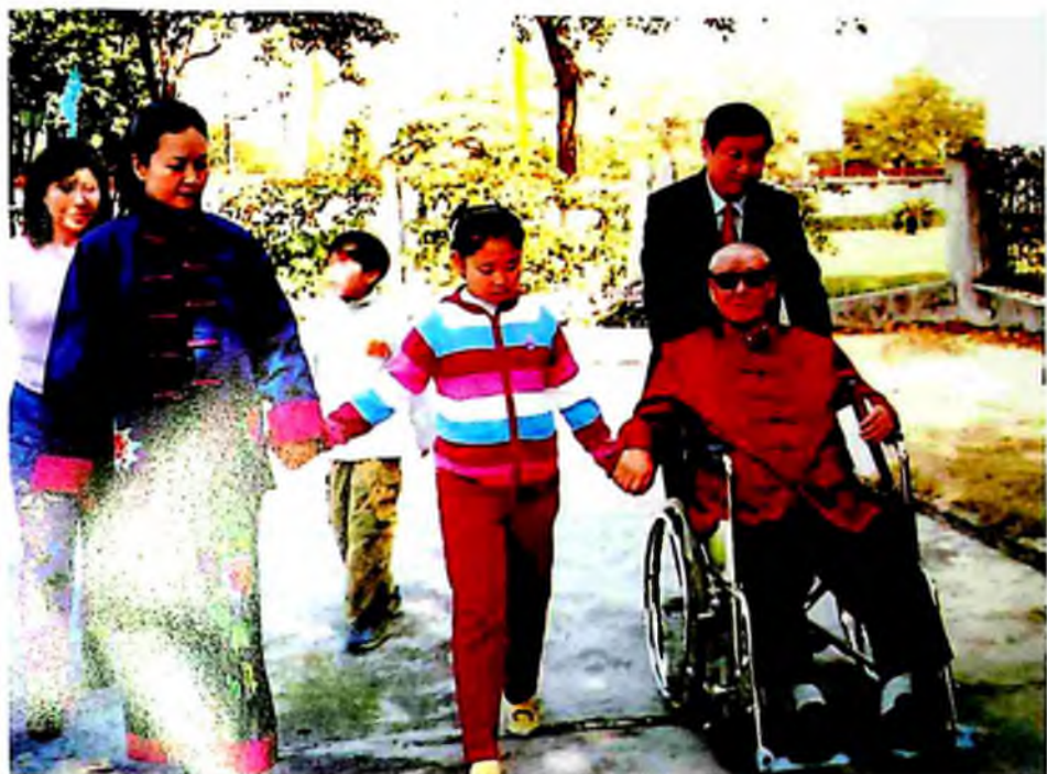
With his wife, daughter and father, Xi Zhongxun.