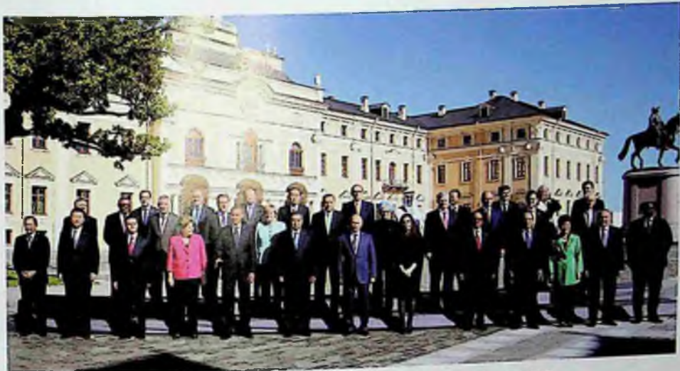
Attending the Eighth G20 Summit in St. Petersburg, Russia, September 6, 2013.