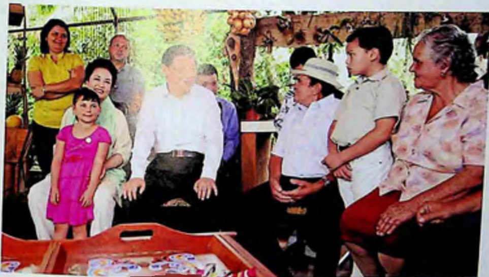
Visiting a farming family with his wife, Peng Liyuan, during a state visit to Costa Rica, June 3, 2013.