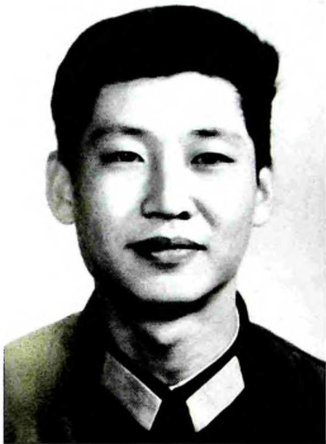
This photo was taken in 1979 when he was serving at the General Office of the Central Military Commission.