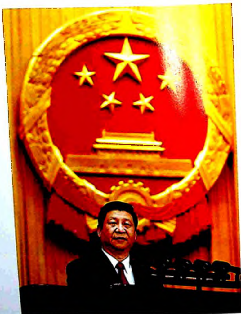
Giving a keynote speech at the closing ceremony of the 12th National People's Congress, March 17, 2013. He was elected president of the People's Republic of China at the First Session of the Congress three days earlier.