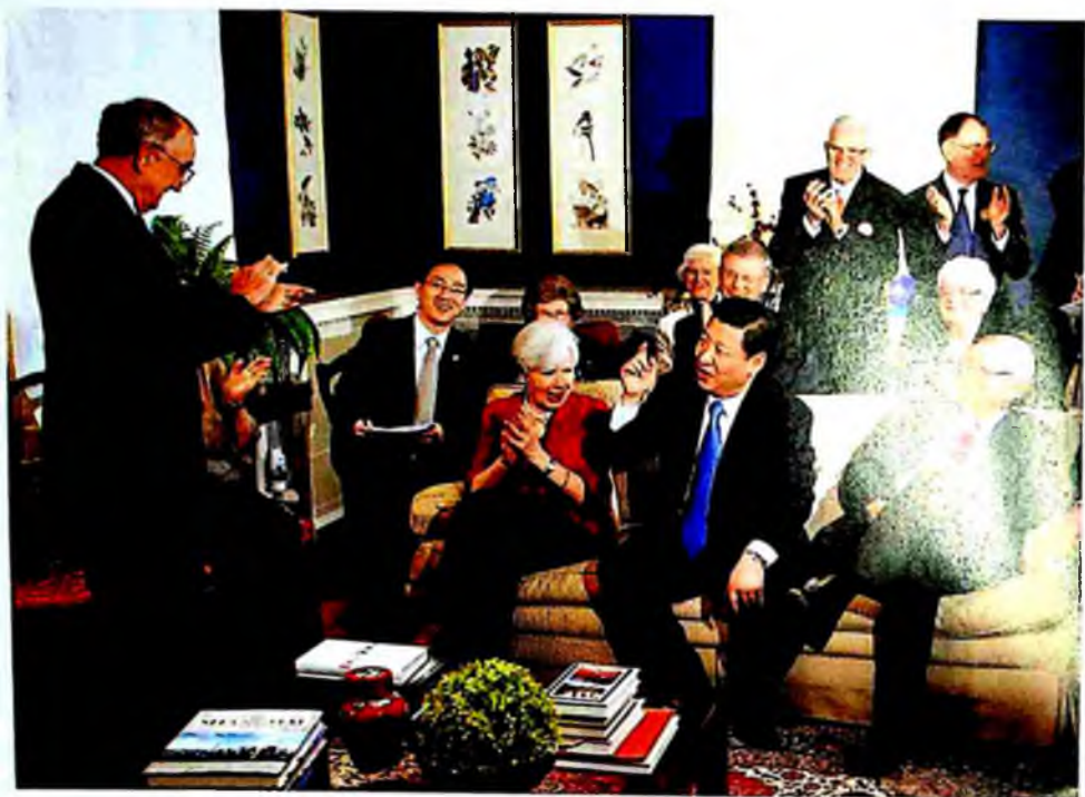
With some of the American friends he made 27 years earlier, on a revisit to the State of Iowa, February 2012.