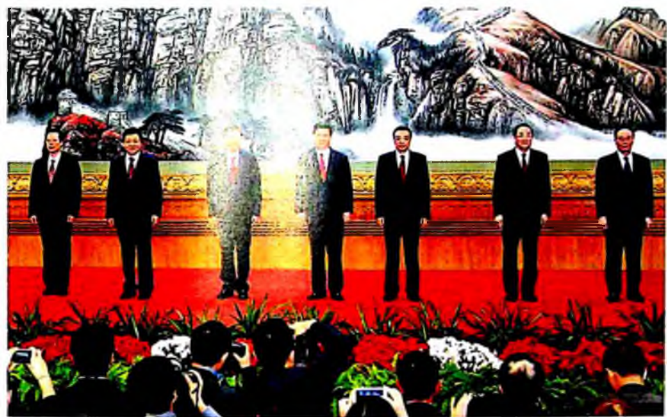
Meeting Chinese and foreign journalists at the Great Hall of the People in Beijing on November 15, 2012, soon after he was elected general secretary of the CPC Central Committee at the First Plenary Session of the 18th CPC Central Committee, along with other newly-elected members of the Standing Committee of the Political Bureau: Li Keqiang (3rd from right), Zhang Dejiang (3rd from left), Yu Zhengsheng (2nd from right), Liu Yunshan (2nd from left), Wang Qishan (1st from right) and Zhang Gaoli (1st from left).