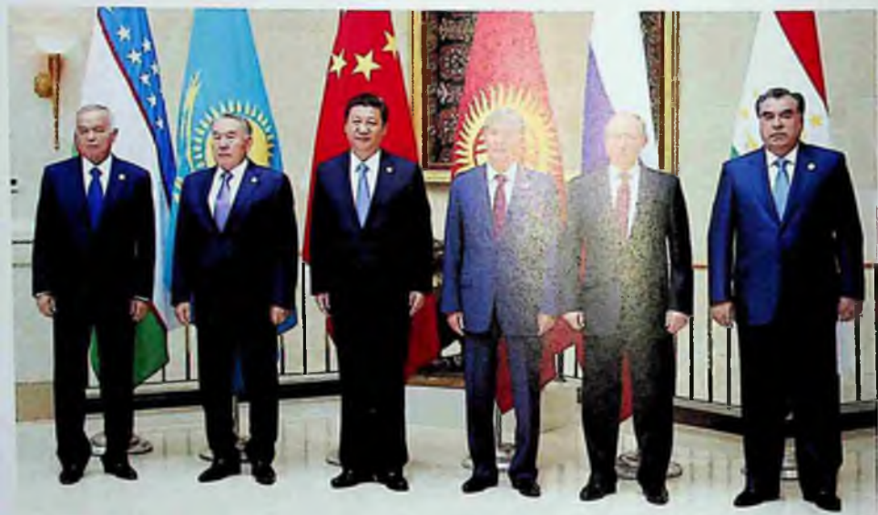
Taking part in the 13th SCO Summit in Bishkek, Kyrgyzstan, September 13, 2013.