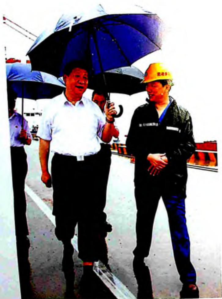
Visiting Yangluo Container Harbor in Wuban, during his inspection of reform and economic development in Hubei Province, July 21, 2013.