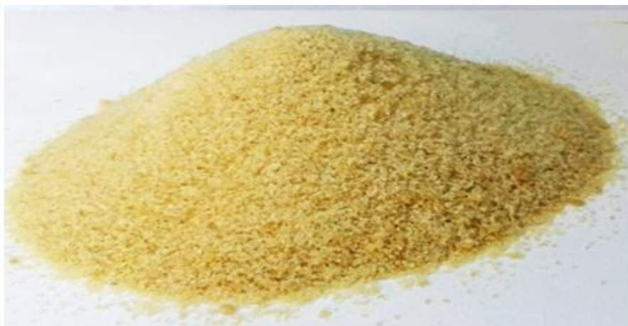
Fig. 4. Dried soap scrap

Increasing the amount of talc magnesite and kaolin in the composition, preparing the fraction in the size of 300-400 microns and less accelerates the adhesion of the product to the metal wire, improves the adhesion of the product to the metal wire, prevents metal corrosion and improves the quality of elongated wire. Lubricant composite does not boil at high melting temperatures, does not decompose, and does not crumble during elongation.