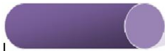
Fig. 2. The state in which the lubricant composite is used

If the elongation process is carried out using a lubricant composite, then the magnified appearance of the product obtained can be as follows (Fig. 2).