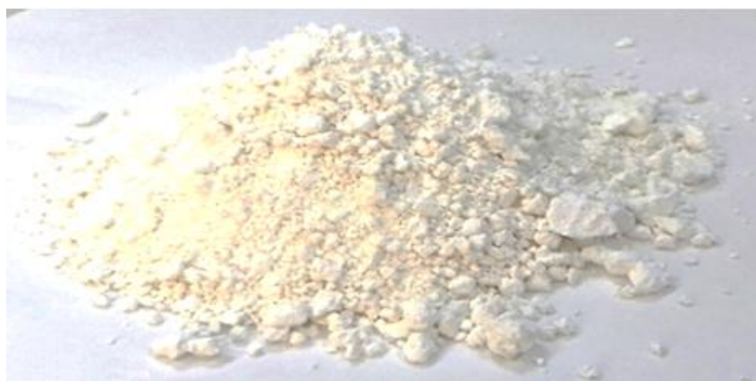
Fig. 3. Calcium stearate

The heated saturated fatty acid was sprinkled with alkali and stirred vigorously, taking small precautions. The resulting calcium soap, due to its higher melting point than fatty acids, solidifies and begins to separate. As the container is tilted, the calcium stearate is collected at the top of the container and the alkali is added to the liquid fatty acid at the bottom. The process continues in this way. When the process is complete, the calcium soap is collected and weighed. The calcium stearate salt obtained by this method is shown in Fig. 3.