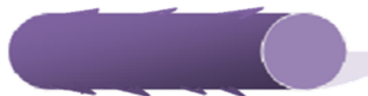
Fig. 1. The state in which lubricant composite is not used

Such steel or other metals are not suitable for similar consumption. If we look at it in magnification, it can be as follows (Fig. 1).