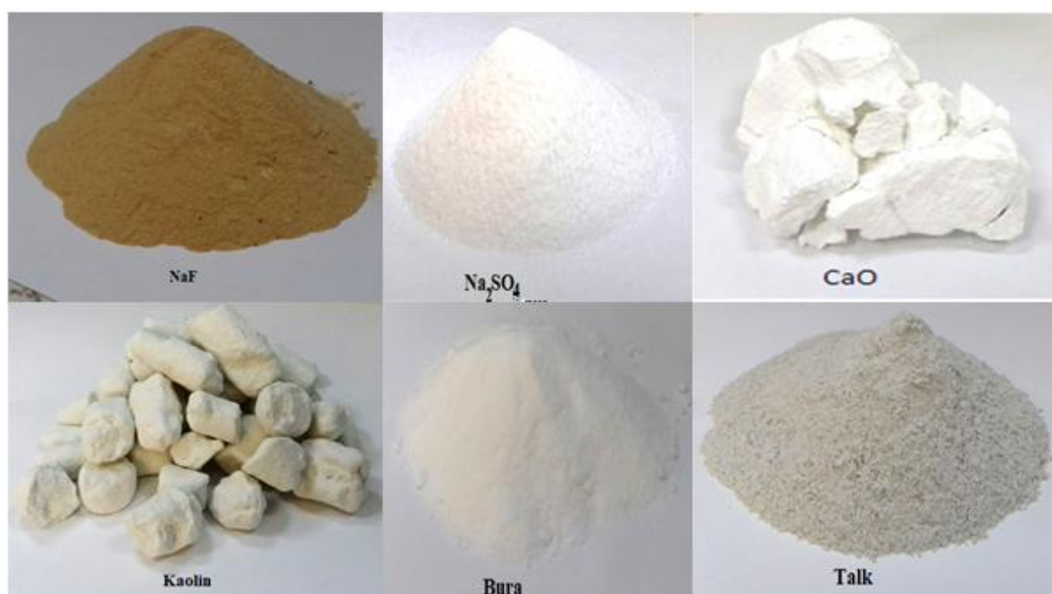
Fig. 5. Ingredients for lubricant composite