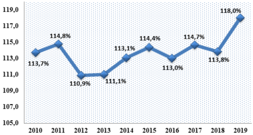
Figure 2. Growth rate of industrial production in Namangan region (in% compared to last year)

these growth rates were lower than last year. It should be noted that by 2019, the growth rate of industrial production in the region will be 18%, the highest in the last decade.